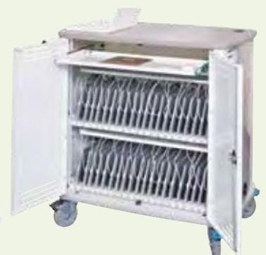
55441 WFCWDW Student side shown with optional storage drawer (55442) pulled out