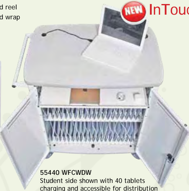
55440 WFCWDW Student side shown with 40 tablets charging and accessible for distribution