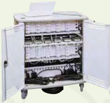
55440 WFCWDW Shown with all 40 tablets plugged into the optional syncing hubs (55444)